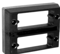
Bezel Customized CAD-Design Partnr.: ON REQUEST