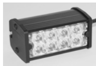
DECK HOUSING Partnr.: WLS8-HS1