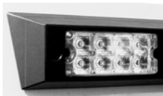
Angled Flushmount Bezels Partnr.: BZ19