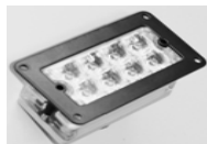
FLUSHMOUNT-BRACKET Partnr.: SP-8FL