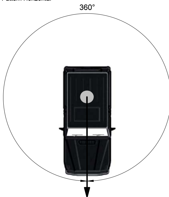
Light Pattern Horizontal